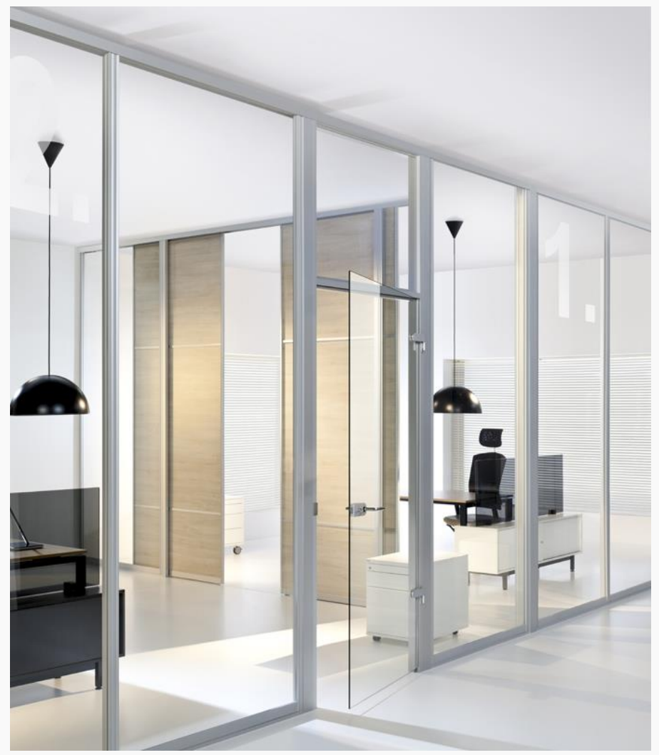
Aurora glazing system for office buildouts