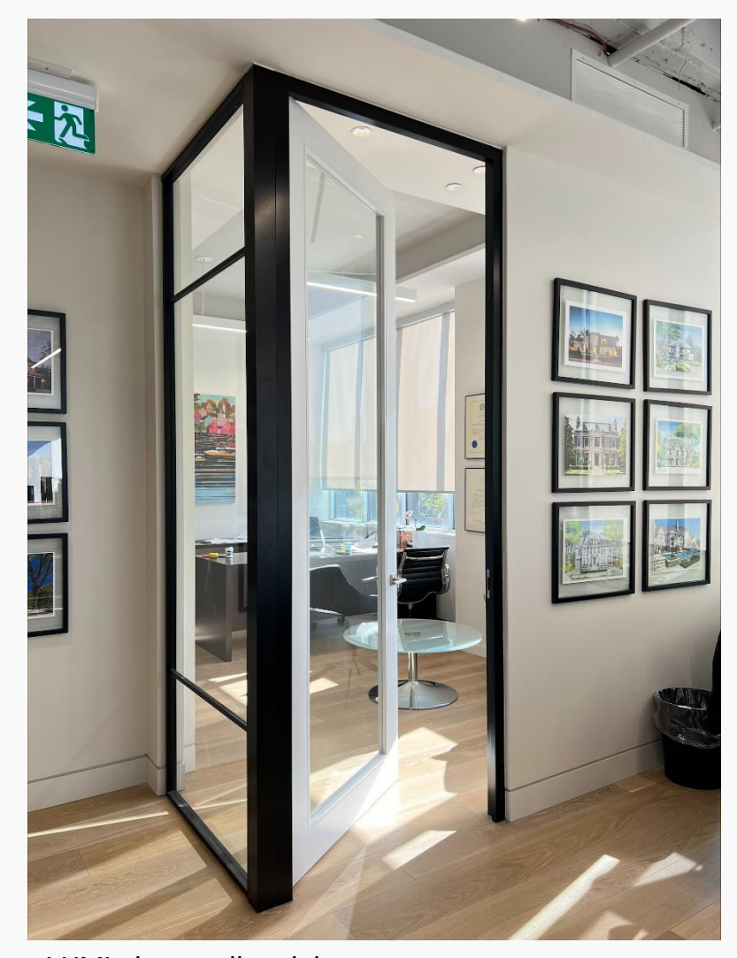
LUMI glass wall and door system