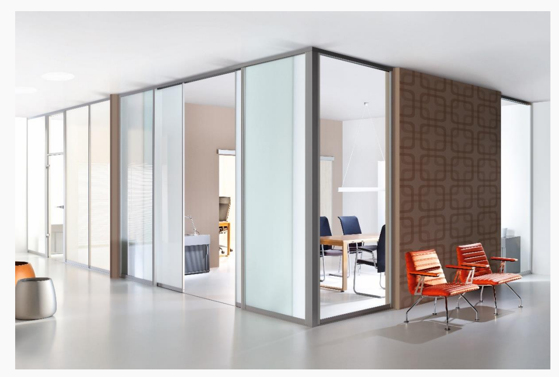
Aurora glazing system for medical and dental offices

The Aurora partition system allows you to divide a large open space into rooms, corridors or office space by building walls out of aluminum and glass. A favored product by architects, Aurora allows the creation of these partitions walls while maintaining privacy and light transmission.