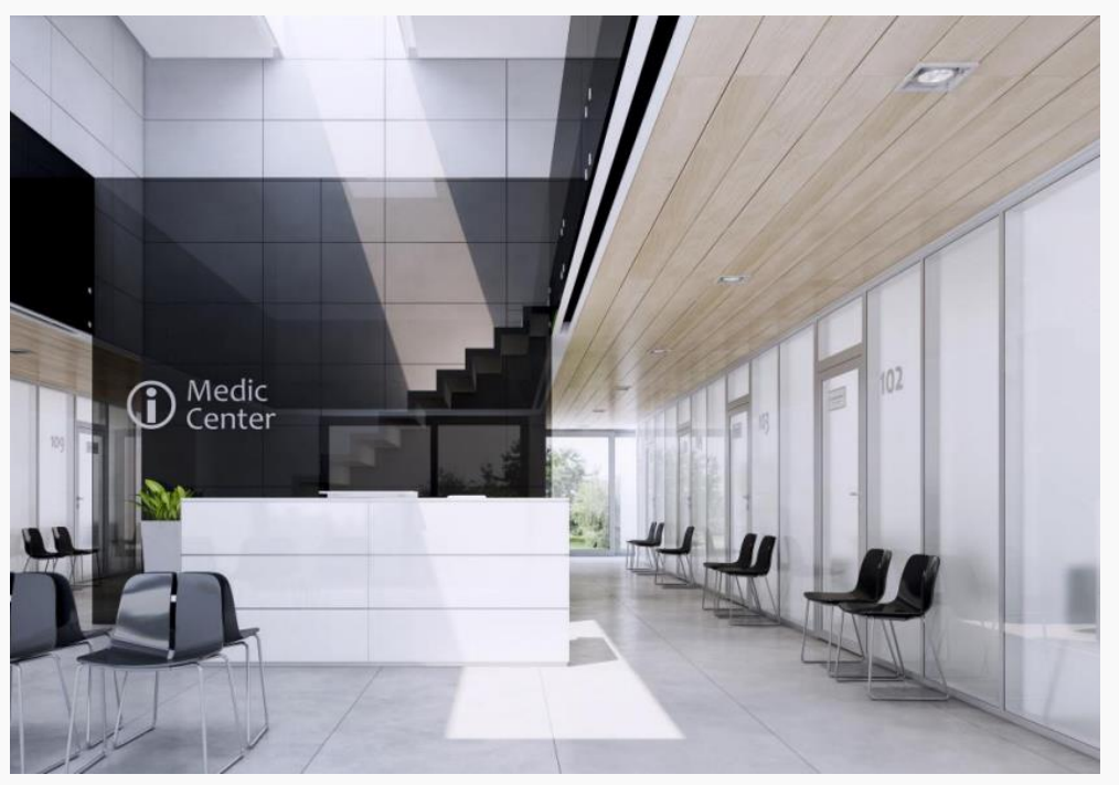
Double glazed TAW-2 system

The TAW-1 glazing system allows the partitioning of spaces without the need for heavy aluminum frames. Spaces can maintain privacy and light transmission if necessary through use of different types of tempered or laminated safety glass.