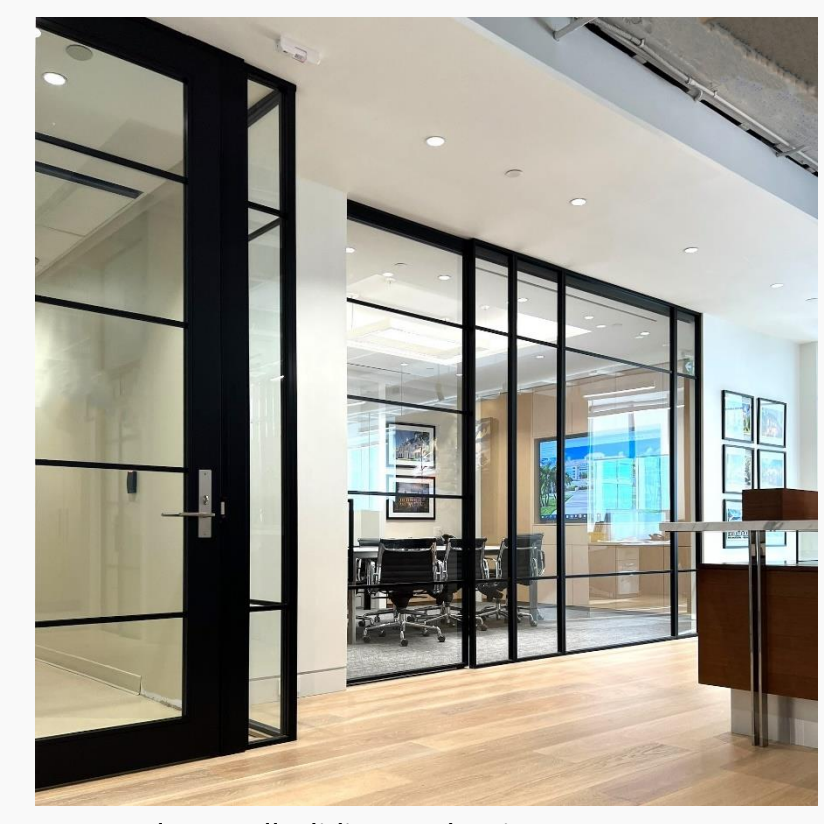
LUMI glass wall, sliding, and swing

Swing | Fixed Panels Sliding | Screens| Corner Posts